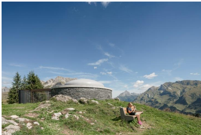
Fig. 5: On the initiative of the private “Horizon Field” society, an organisation that promotes cultural projects in the county of Vorarlberg, a new Skyspace has taken shape in the alpine landscape around the picturesque village of Lech am Arlberg.