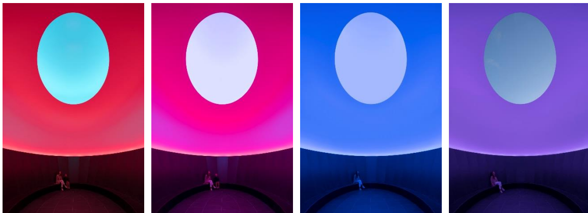
Fig. 3: Turrell devises his Skyspaces to achieve a unique connection between the earth and the sky.

Fig. 2: The installation is accessed by a tunnel that has been carefully aligned to deliver dramatic views of the imposing Biberkopf peak, before finally opening out into the light space itself.