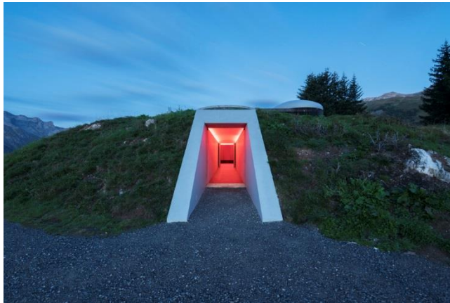
Fig. 1: The impressive effect of Turrell's light-poetic contemporary art can really be experienced in his latest project of the Skyspace Lech in Vorarlberg, Austria, in the stunning natural scenery of the Arlberg, nestled between hiking trails, alpine passes and stunning mountains.

(Photo credits: James Turrell Photo: Florian Holzherr)