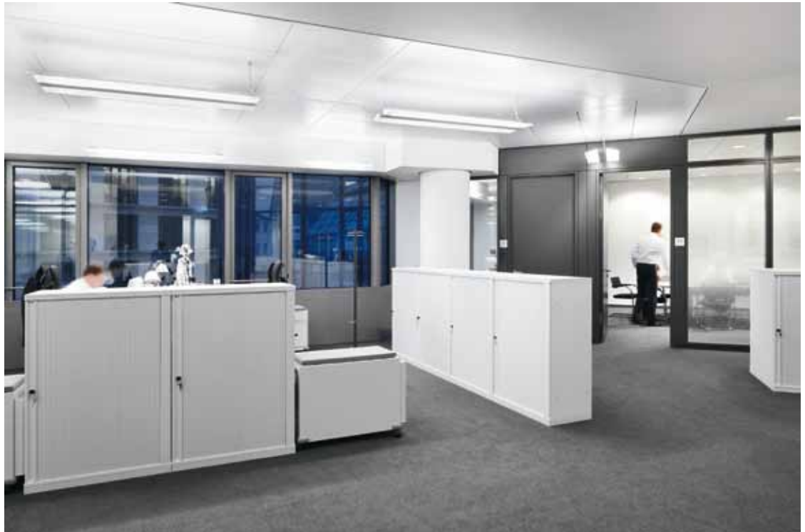
B7 | A pendant version of the sword-shaped luminaire illuminates the work places on the ground floor and other areas.

with a 3,000K colour temperature and a broad angle of radiation, together with an opal PMMA covering. LED equipment and a light output ratio of 73% are moreover exemplary in terms of energy efficiency and LEED criteria. The large conference room on the 35th floor of Tower A is worth a special mention: the texture of the cen-