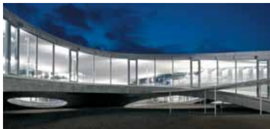
B7 | Rolex Learning Center from outdoors, showing rooms outwardly illuminated with pure white light