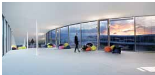
B6 | Lighting situation in the Rolex Learning Center at sunset

graduate researchers are set up as meeting „bubbles“. Minimalist free-standing luminaires create an agreeable working atmosphere there when there is insufficient daylight. The Rolex Learning Center is at its most impressive just before sunset when, for one magical moment, thanks to the cumulative effect of the reflections of the setting sun, the dark blue of the sky and the pure white interior illumination radiating outwards. At this moment, this outstanding building is transformed into a unique sculpture of space and light, providing perfect lighting to relax after a tiring working day. Zumtobel. The Light.