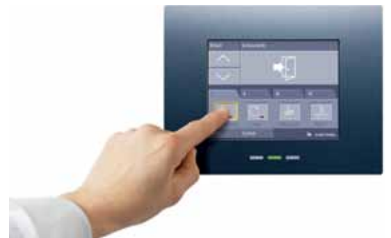
B4 | Zumtobel Emotion Touch Panel