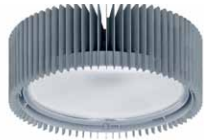
B3 | Module with cooling fins in the Panos Infinity LED downlight range

In the process, good colour rendering in a range from 2700 K to 6500 K not only improves perception, it also creates eye-catchers, highlights colours and works in harmony with human bio-rhythms. Besides Panos Infinity, Zumtobel also offers other luminaires in its product range with Tunable White functionality. This provides a variety of ways of using artificial lighting to mimic the natural changes in daylight over the course of a day, and opens up fresh possibilities for dynamic office lighting.