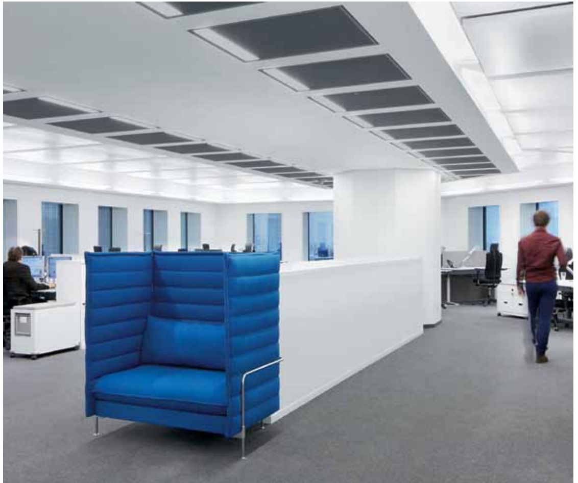
B2 | Deutsche Bank offices in Frankfurt equipped with a custom solution by Zumtobel