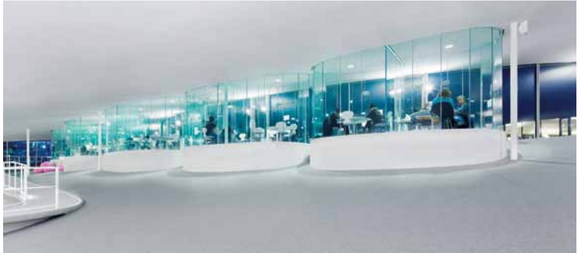
B5 | Offices/meeting „bubbles“ for postgraduate researchers in the Rolex Learning Center